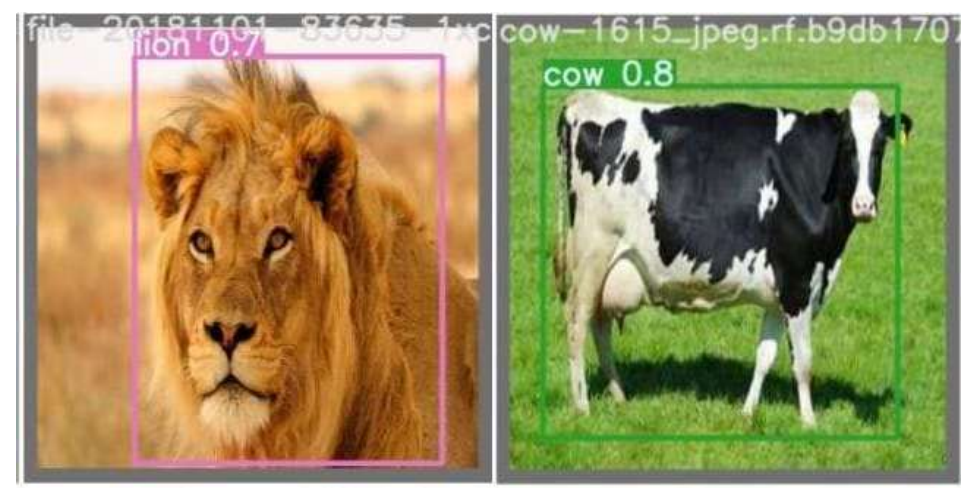
Fig. 2: Expected Outcome

A model Trained with a suitable dataset should be identifying the animal Species. After identification, the model should classify the animal by specifying the name of the animal. Fig. 2 represents an expected output.